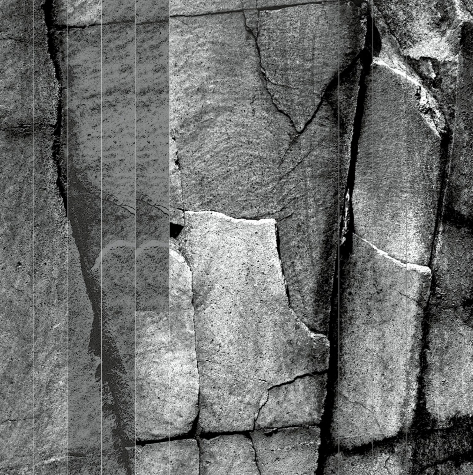
DAME BARBARA HEPWORTH, IMAGE II, 1960, TATE