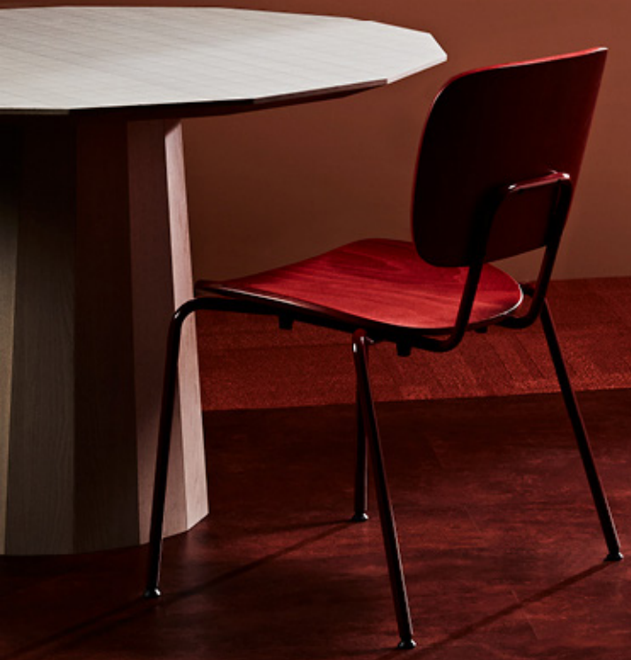
VIVID 101 COPPER POT 56

When inspiration strikes, explore and combine Signature's suite of floor concepts.